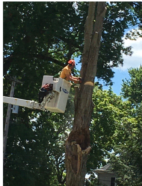
On the right: This tree sat in the front of the church. Over the last couple years several large limbs fall down. The session decided to Richardson Tree Service cut it down for safety.